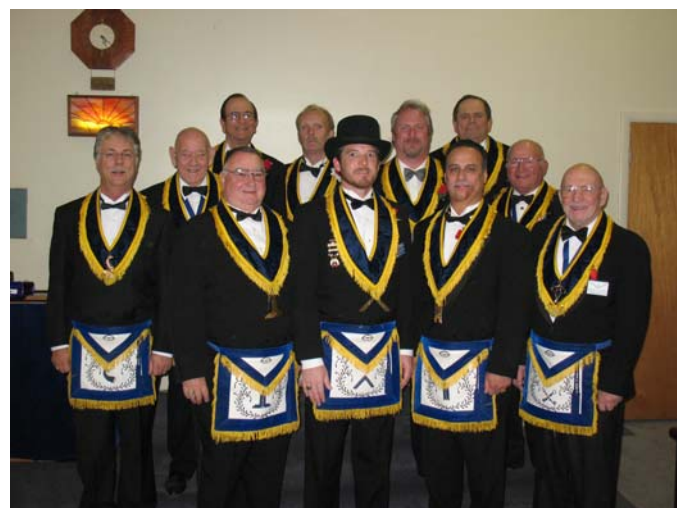
2009 Lodge Officers

It can be! This story gives one version: A man was checking in at a Hotel, and while at the Registration desk, he noticed a group of men heading toward a function room. He said to the Clerk, “Who are those men?” She replied, “Oh, they’re the Masons. They are meeting in one of our function rooms until their new Lodge is finished.” He replied, “Oh yeah, the Masons! Isn’t that the group that’s so hard to get into?” She replied, “You don’t know the half of it!. See that man with the sword? He’s been banging on that door for eight months and they haven’t let him in yet!”