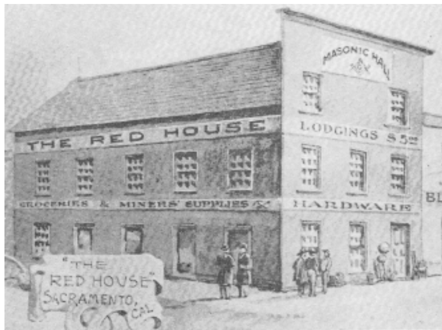
THE RED HOUSE

John Bigler—Tehama Lodge No. 3—Sacramento. J. Neeley Johnson—Tehama No. 3—Sacramento. Henry H. Haight—Pacific Lodge No. 136—San Francisco. Milton S. Latham—Washington Lodge No. 20—Sacramento. John G. Downey—Los Angeles Lodge No. 42—Los Angeles. Leland Stanford—Michigan City Lodge No. 47—Michigan City. Romualdo Pacheco—San Luis Obispo Lodge No. 148—San Luis Obispo. Demitted to Washington Lodge No. 20—Sacramento. George C. Perkins—Oroville Lodge No. 103—Oroville. George Stoneman—Temple Lodge No. 14—Sonoma (also Benicia No. 5). Henry S. Markham—Corona Lodge No. 324—Pasadena. George Pardee—Oakland Lodge No. 188—Oakland. Hiram W. Johnson—Washington Lodge No. 20—Sacramento. William D. Stephens—Southern California Lodge No. 278—Los Angeles. Friend W. Richardson—Durant Lodge No. 268—Berkeley. C. C. Young—Sequoia Lodge No. 349—Oakland. James Rolph, Jr.—California Lodge No. 1—San Francisco. Frank Merriam—Seaside Lodge No. 504—Long Beach. Earl Warren—Sequoia Lodge No. 349—Oakland.