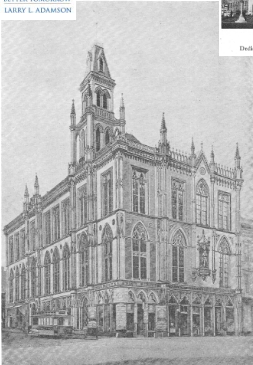
FIRST MASONIC TEMPLE IN SAN FRANCISCO Post and Montgomery Streets. Begun in 1863, completed in 1870, and destroyed by fire in 1906.