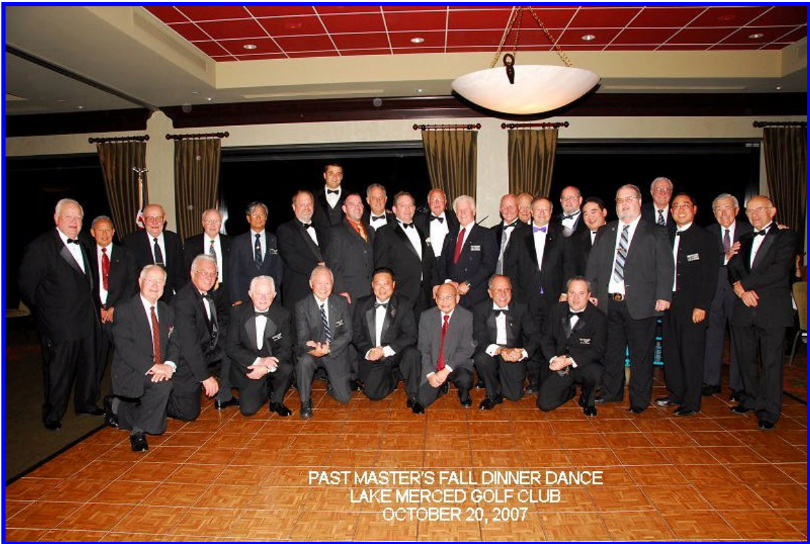
A GREAT EVENING.